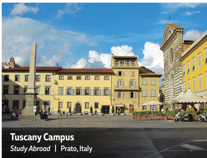
Tuscany Campus Study Abroad | Prato, Italy

The Metropolitan Nashville Police Department responded with no reportable crimes at this location for reporting years 2017, 2018, or 2019.