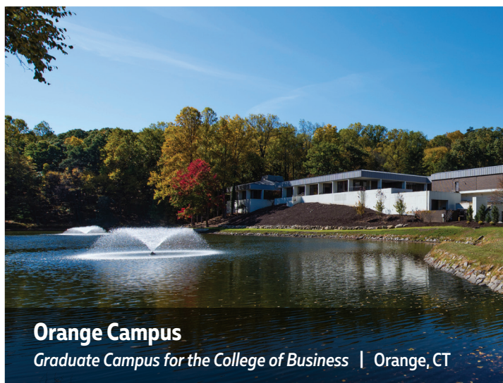
Orange Campus Graduate Campus for the College of Business | Orange, CT