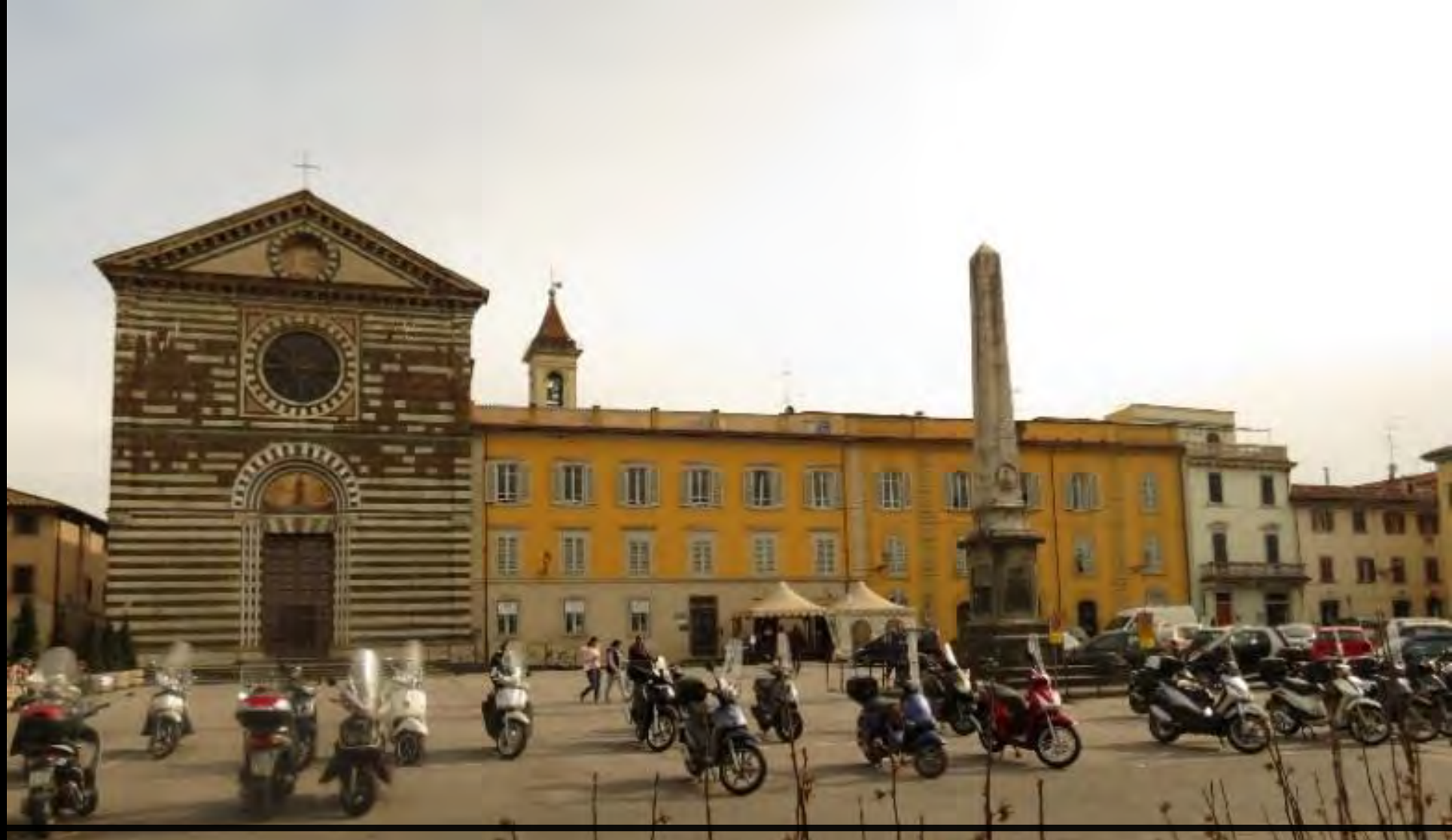
Semester in Prato, Italy