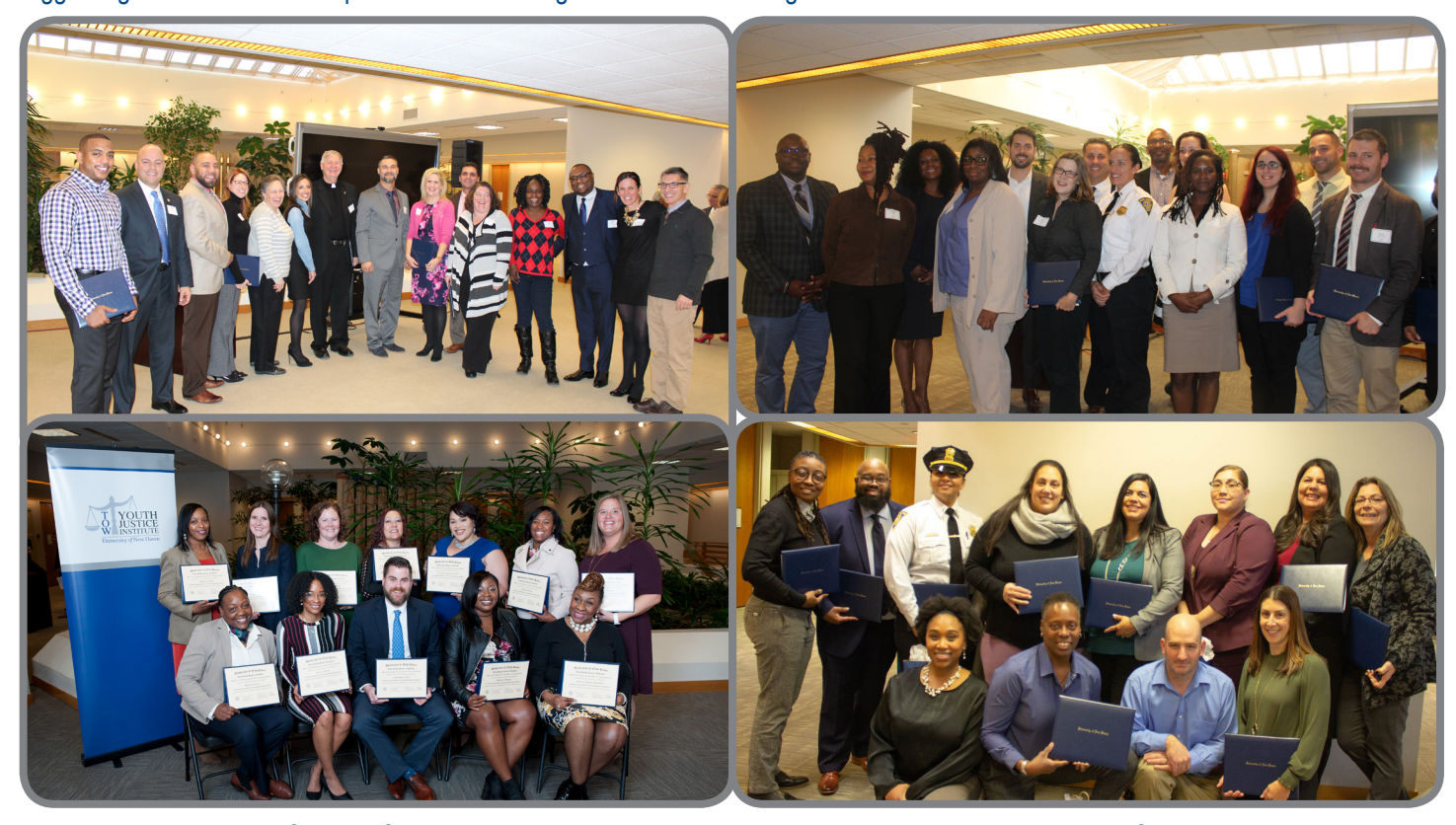
See our 2018 Winter Newsletter to learn more about the program. The 5th Cohort in 2020 begins in April!