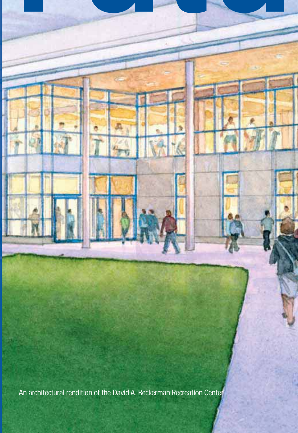
An architectural rendition of the David A. Beckerman Recreation Center

The Strategic Directions will continue to unfold, creating a University that is a paragon of intellectual excellence and exploration.