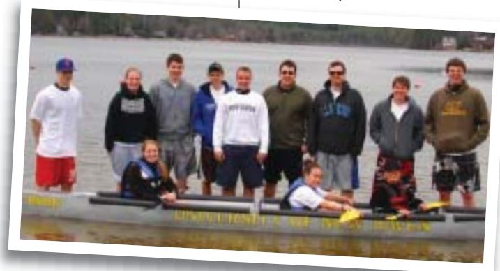
The University's Concrete Canoe Team