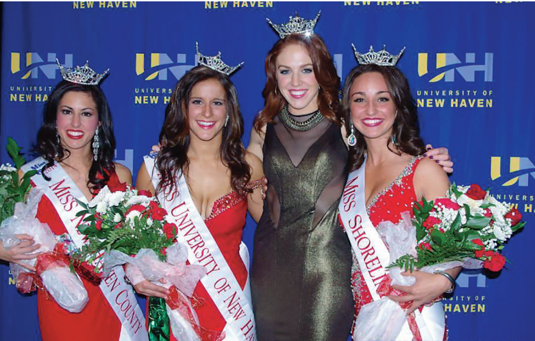
2014 Titleholders with Miss Connecticut 2013

The Miss Connecticut Pageant serves young women aged 17 to 24 and is an official preliminary to the Miss America Pageant, the nation's leading achievement program and world's largest provider of scholarship assistance to young women. Participation provides young women with the opportunity to promote a platform of community service and share their talents, intelligence, and positive values while serving as role models in their communities.