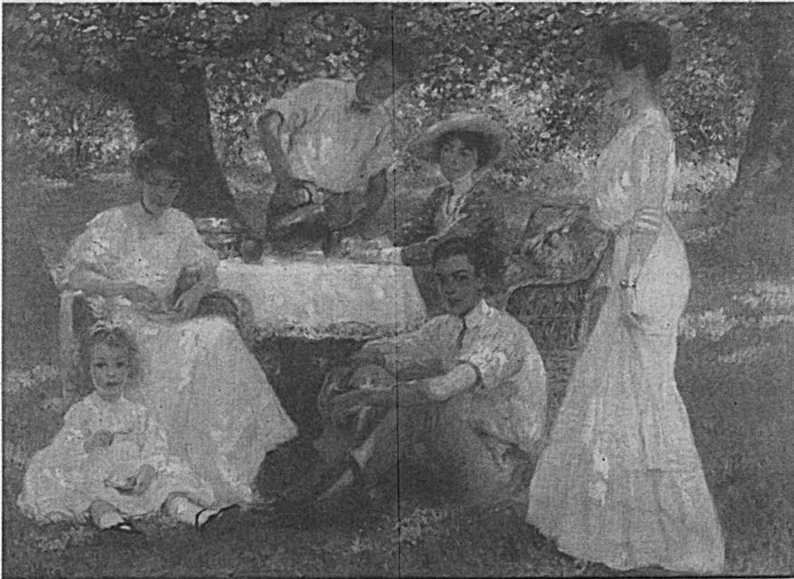
F. Luis Mora's "Shadows in the Orchard" at the Mattatuck Museum in Waterbury on Sept. 26.