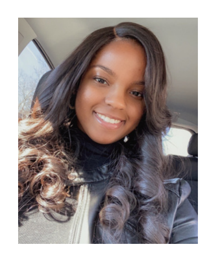
"Looking back gives you regrets. Looking ahead gives you opportunities"