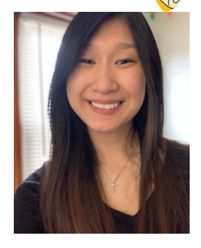
"When you start to lose motivation, think about why you started in the first place."