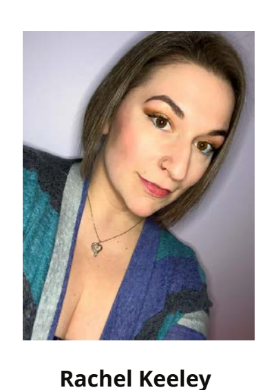
"One can choose to go back toward safety or forward toward growth. Growth must be chosen again and again; fear must be overcome again and again." - Abraham Maslow