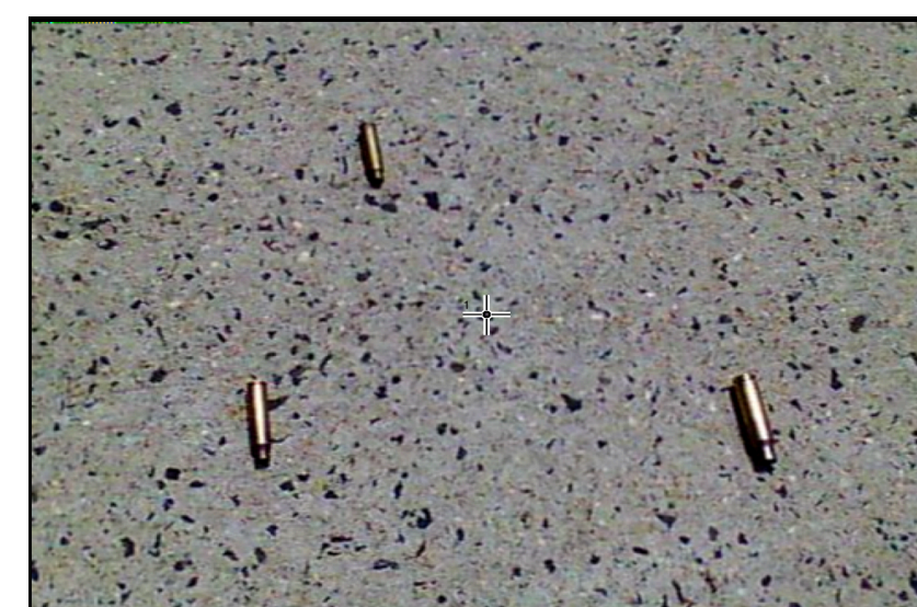
Figure 2: Casings placed on concrete. Digital image.

The Initial testing proved that the shell casings had the ability to heat to a higher degree than the surface it was deposited on. When the ambient temperature according to The Weather Bug was 82°F with a relative humidity of 75%, the thermometer registered an ambient temperature of 88°F. When the casings were in direct sunlight for fifteen minutes, the thermometer placed inside the casings registered the temperatures as indicated in figure 4.