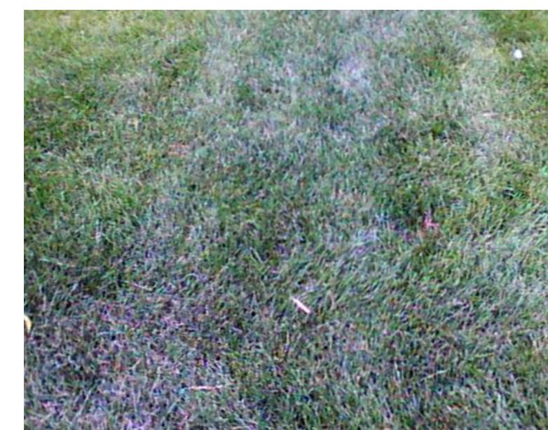
Figure 5: Casing on Grass. Digital Image