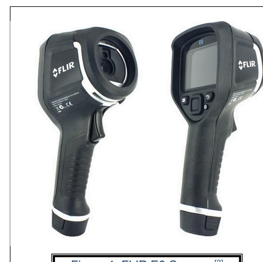
Figure 1: FLIR E6 Camera [3]